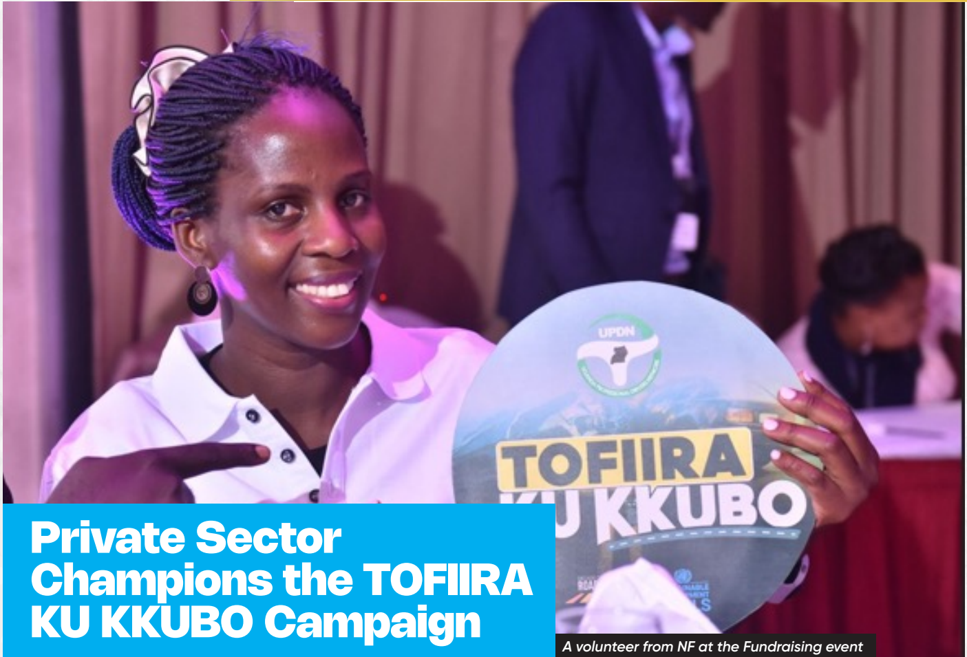
A volunteer from NF at the Fundraising event