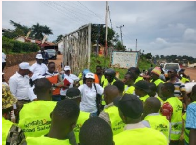
Road safety awareness training for boda boda operators during the launch event

The foundation is committed to working with Nile Breweries and its partners in implementing the Ondaba Campaign to reduce and eliminate fatalities on this highway, more so as we approach the festive season.